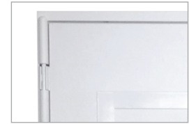
Narrow frame vs. Regular frame